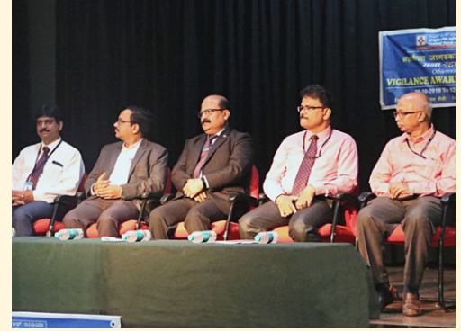
Awareness on using E-portals of Banking Systems.