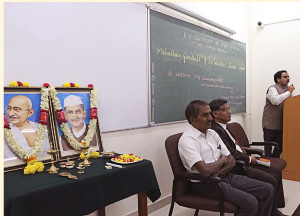
Gandhi Jayanthi Celebration