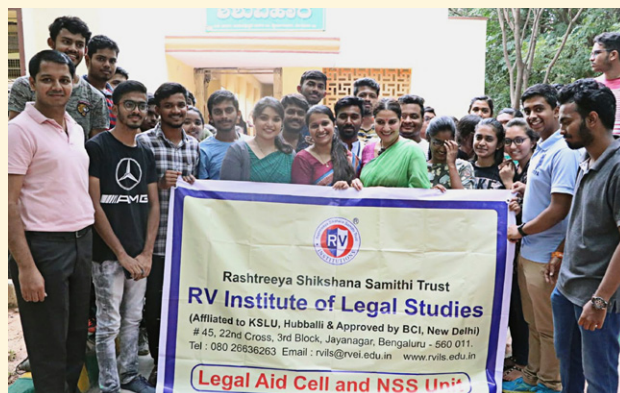
Legal Aid programme and NSS activity.