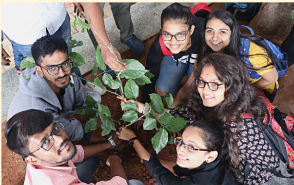
In remembrance of Breath of Balidhan, planting of saplings in name of the brave hearts.